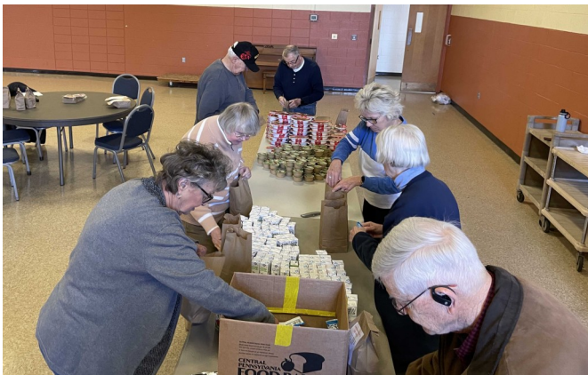
Board members assembling emergency meal bags

Before inclement weather hits, clients are provided with a free shelf-stable emergency meal. It includes a microwavable entrée, dessert, snack, and a drink. We provide that meal over the winter months in the event that hazardous weather prevents us from delivering our noon-time meal. Replacement meals are delivered after each use. In the winter of 2025, we created and delivered 5 emergency meals to all of our clients, all at no charge to them.