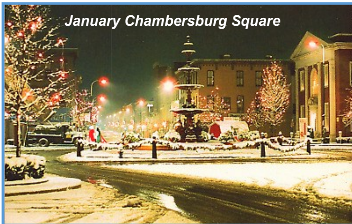
January Chambersburg Square